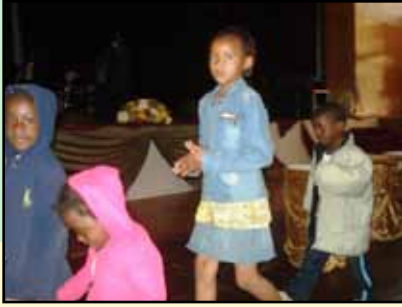
Kids taking their offering to the altar

Many of you labor to make this mission possible and we give God thanks for every aspect of your partnership with us – whether through prayer, financial support or performing tasks on our behalf at great personal sacrifice. God is using your partnership with us to bless many others also. And so, we never cease to thank Him for you and your faithfulness. We pray for you often and always make mention of you at our seminars.