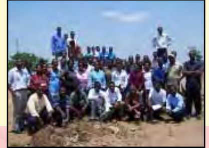
Seminar in Gweru

We wish you, our dear friends in the U.S, Happy Thanksgiving. We have fond memories of sharing Thanksgiving dinners with some of you. Thank you for grafting us into your family. .