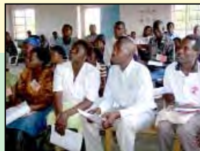
Seminar in Gweru

are becoming sensitive to the need to have the Church mobilized for missions. This, in turn, is exposing the urgent need to help churches develop Bible-based discipleship ministries. Yes, there is an awful lot of work to be done here but it sure seems like the Lord is setting the stage for something really great; not temporal but truly eternal.