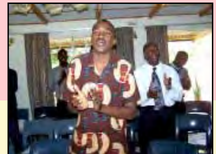
Worship time at a seminar in Harare

We are greatly encouraged by these developments and are moving along the same track. We praise God that He has shown us these things and are deeply grateful to Him for the privilege of being part of what is happening here.