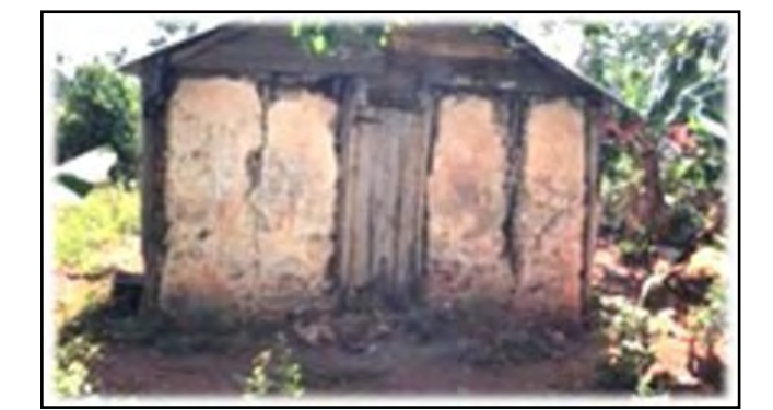
Ipharanie's old home