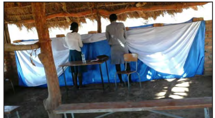
Setting up for worship