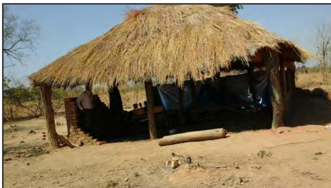
Doubles up as Church and pre-school for 70 kids

Two days ago, we drove to a very rural part of the Country to address a Conference. The journey we were told would take only 90 minutes, actually took 3¼ hours and the distance was not 45 but 80 kms. The roads were the worst we had ever travelled on. In many ways, it was a real eye-opener for us. The people hardly ever leave their rural and rough setting; but they are so gracious and spiritually hungry!