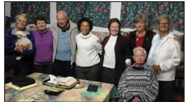
Our friends at Resthaven, Rusape

Our classes in Rusape, Chegutu and Gweru continued during June and July. In June, we decided to terminate our Rusape group. Not only had we been there for three years but we felt that we were not seeing the level of commitment to the Lord that we are looking for. This has not been for want of trying. After seeking the Lord, we felt sure that our last class should be in July, which it was. The Chegutu and Gweru groups (both One in Christ and the two Bible College groups) continue to be very encouraging. This being a school holiday month, we have no classes but we're back on the road on September 2nd and 3rd to Chegutu. From the afternoon of the 3rd until the 9th, we'll be in Gweru and on the 22nd and 23rd we meet with pastors in Domboshawa.