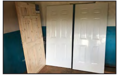
Iliody's New Doors

As we continue to pray and plan for our transition to Haiti, some activities are progressing in our absence. A couple of those are our future neighbor's home and our vehicle repair.