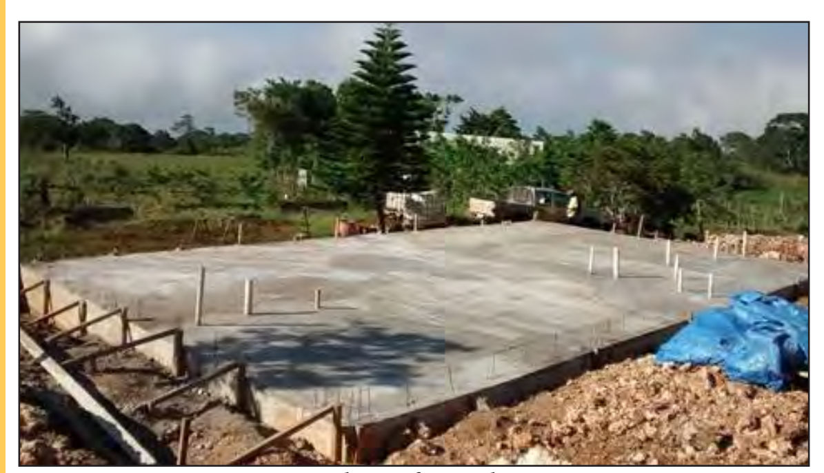
Foundation for our house

Here's the finished foundation and floor. This crazy thing took 168 bags of cement and 2 days to pour. On one of our down days, we installed some poles with the hope of getting fiber optic from Haitian cellphone company. As is to be expected, the poles have yet to used.