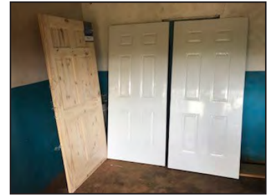
Iliody's New Doors

As we continue to pray and plan for our transition to Haiti, some activities are progressing in our absence. A couple of those are our future neighbor's home and our vehicle repair.