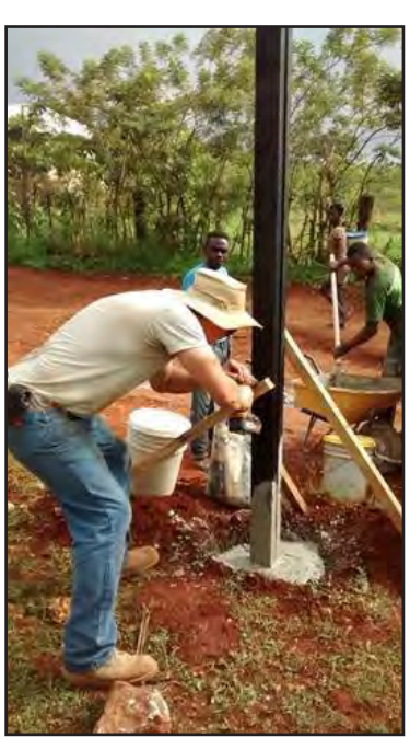
Fiber Optic pole

One project that I have nothing to do with, is the renovation/addition onto to the clinic. I mention it because it is an answer to prayer. Our Haitian doctor took it upon himself to find the funding to renovate the wing of the clinic show here. The question of how well they estimated the project remains. We'll have to wait and see.