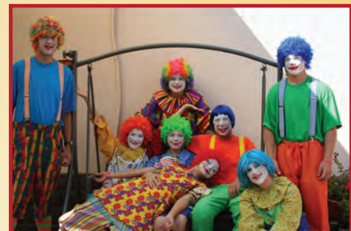
Romanian/Ukrainian Clown Team