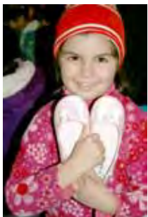
For the children from Fonau we even had shoes.

When we have so much every day, it is sometimes hard to still appreciate the simple things. Before we started our program with puppets and bells in Fonau, we had a snack for the children with some hot chocolate! Do you know that most of them had never had hot chocolate, not even once in their lives? So sad but so true!! We take so much for granted, pretending that we cannot help people around us when so little needs to be done, but what a big impact it can have!!