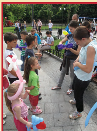
Ukrainian Clowns practicing doing balloons