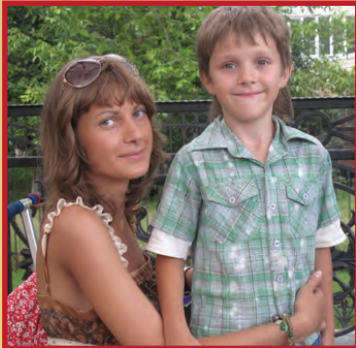
Lady who gave us Biscuits & Water

A bit taken back, she inquired why they would stand out in the hot sun for a long time just to give children balloons. As the opportunity presented itself, we explained who we are and that Jesus never asked us to pay for our sins. It is because of that love that we are out here giving out balloons to the children. It was difficult for her to understand why we did not want something in return and she left. After about fifteen minutes, she returned with biscuits and water for all of the clowns.