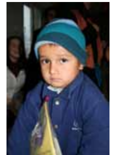
They were holding them so tightly; making sure that nobody could take it away.