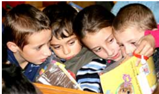
Only watching them could you understand what these little gifts meant to them.