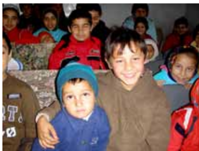
It was so wonderful to watch their precious faces enjoying every minute of the program. With your help, at the end of all this, they received bags with little gifts.