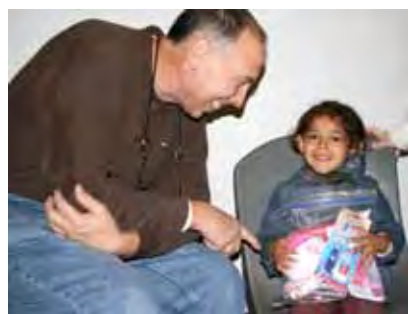
For them, who have nothing or so little, these bags and shoes were like treasures.