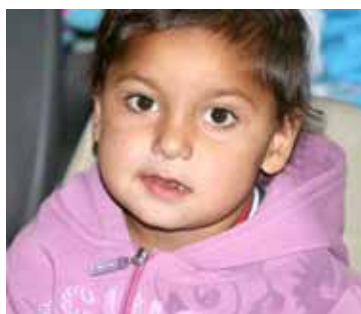
When I asked them if they liked the hot chocolate they all answered, "YES"...but some of them, with more courage, said: "We like it! But what is it? We never had this before!"