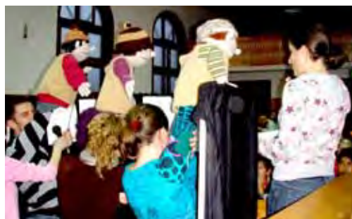
The Great News of Jesus' birth was brought to them thru puppets, bells and stories!