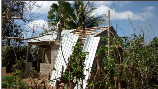
Takes only one day for the roof