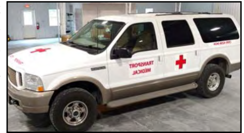
Ready for its Haiti Excursion