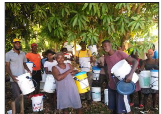
Another Successful Filter Distribution

May the peace of our Lord remain in your hearts, he is our Hope!