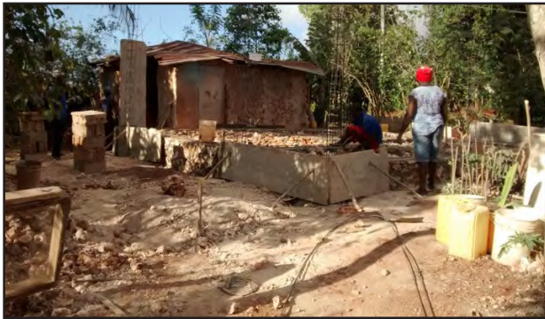
New foundation with old home in back

We continue to pray that this year brings blessings to each of your lives. Despite the many difficulties we collectively face, God's amazing providence and comfort continues to awe us. When we look, we see his Salvation.