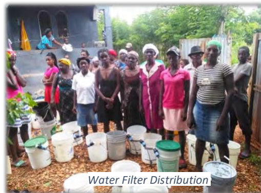
Water Filter Distribution