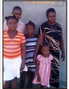
Family in front of their new home