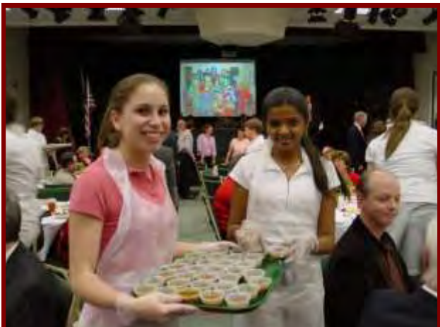
Student volunteers from local high schools helped with the serving of the food