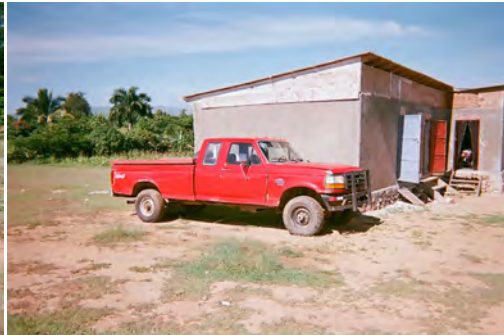
New, to us, '94, 4X4 diesel F250 Pick-up - A Great Blessing!