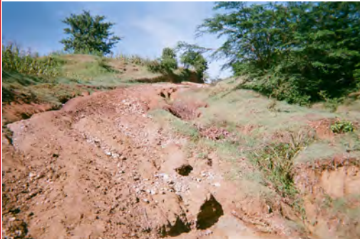
6.3 mile "road" off pavement to Shiloh Children's Home

"Lo, children are the heritage of the Lord..." Psalm 127:3