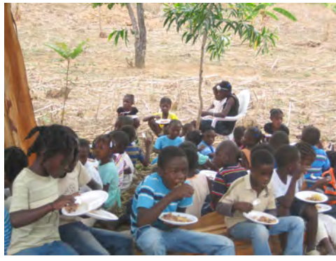
Feeding 100 children at VBS each day!