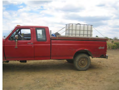
New to us truck and cistern for collecting water.