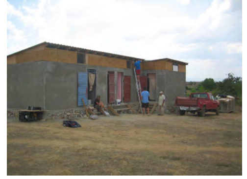
Our new SCH residence!