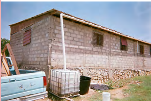
Six months a year we are able to collect rain water off of the roof