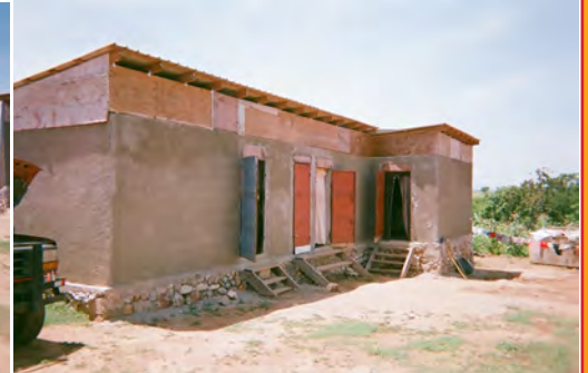
Newly constructed Shiloh Children's Home