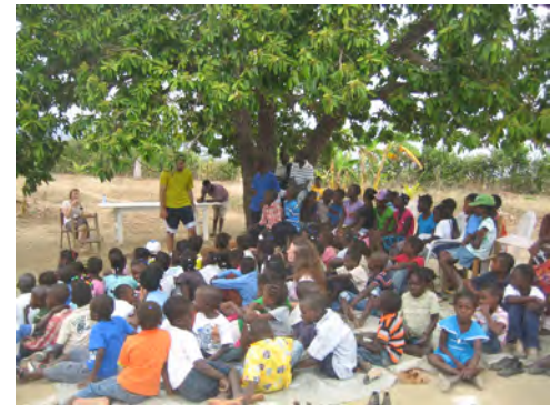
VBS Bible Time