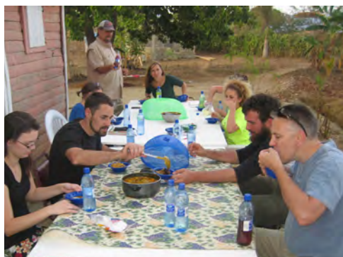
Meal time for Ocala, FL team!