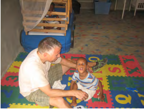
Doctor from FL checking basic health for SCH children