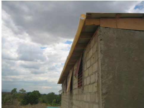
Rain gutters collecting water for washing and cooking for SCH.