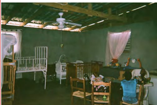
17x24 Childrens Room