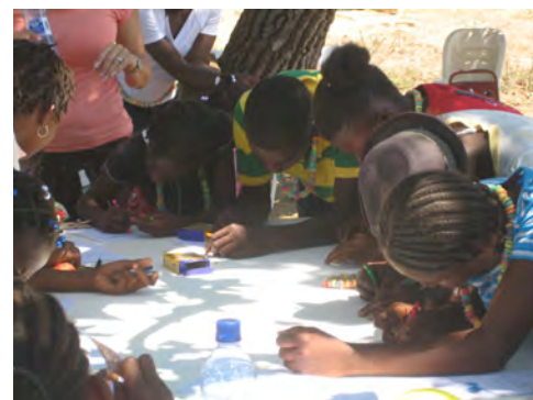
Arts & Crafts during VBS!