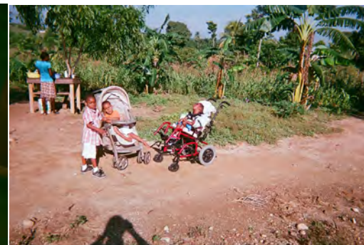
All the children love being outside, enjoying the fresh air & sunshine!