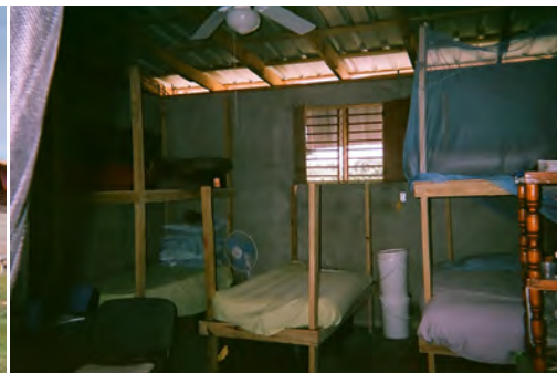
14x17 Our Apartment / Team Room