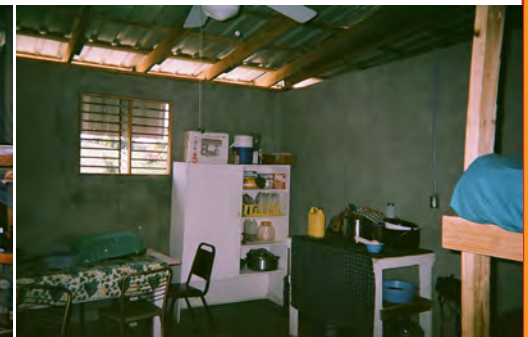
12x17 Kitchen / Team Room