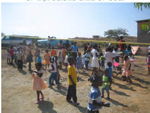
Games during VBS!!